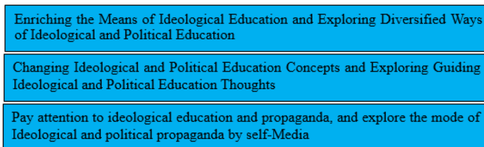
Figure 2. Research on the Innovative Development Path of Ideological and Political Education in Colleges and Universities

As shown in figure 2, a detailed analysis is presented above.